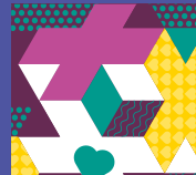
MedTech & Healthcare