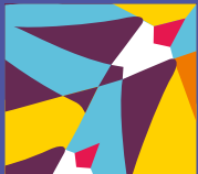
Aerospace & Defense